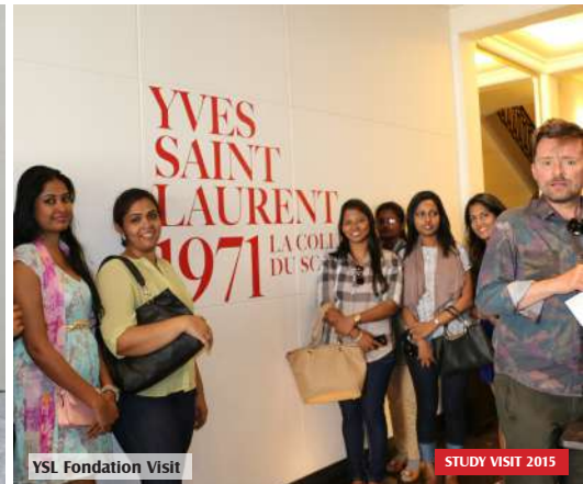
YSL Fondation Visit