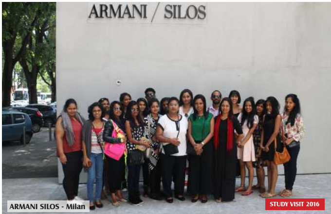
ARMANI SILOS - Milan