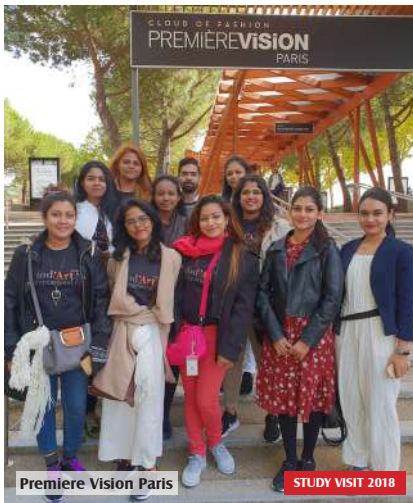
Premiere Vision Paris