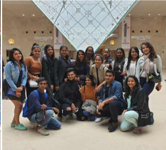
Visit to Louvre Museum