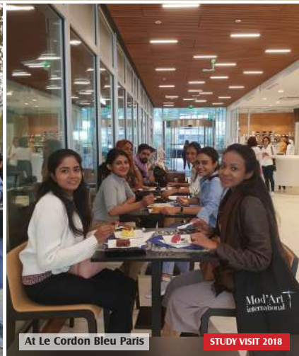
At Le Cordon Bleu Paris