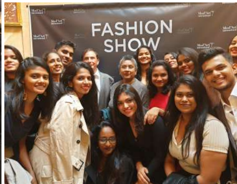
PARIS, LONDON, MILAN, NEW YORK