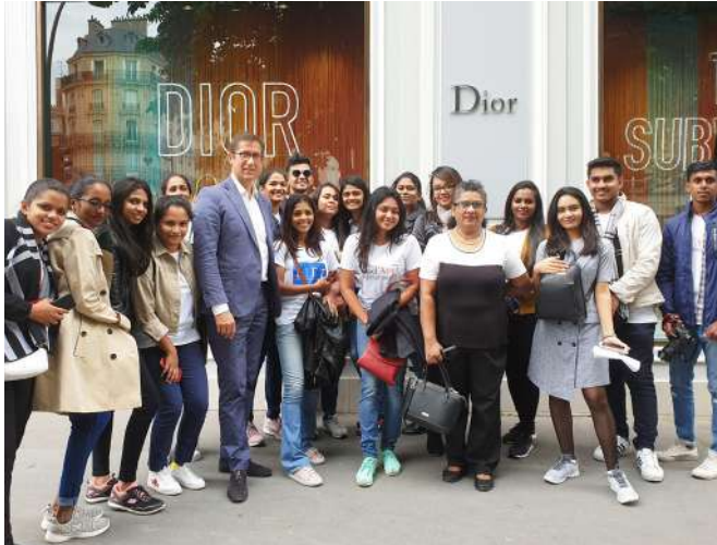
Visual Merchandising Visits at Dior Flagship store