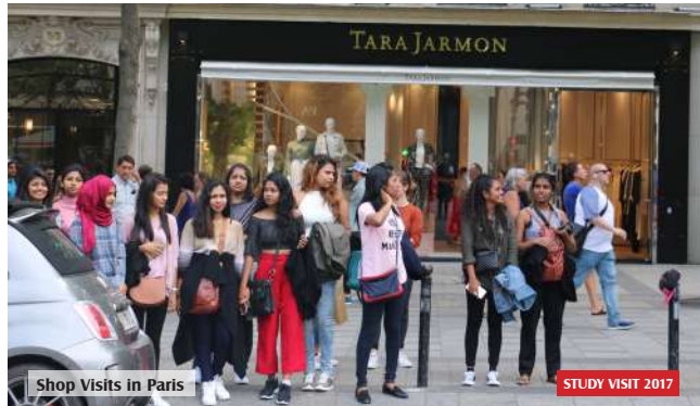
Shop Visits in Paris